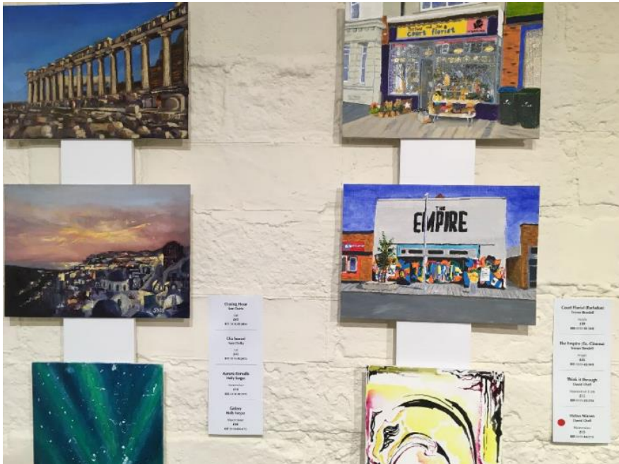
A typical selection